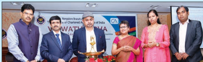
Inauguration of the Seminar by lighting the lamp