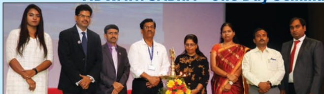
Inauguration of Seminar-VIDWATH SABHA by Lighting the lamp