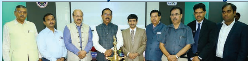
Inauguration of Seminar-VIDWATH SABHA by Lighting the lamp