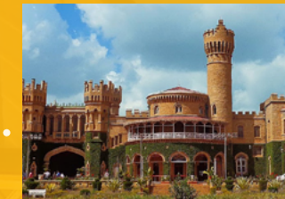
BANGALORE PALACE Dist. from Majestic - 3.3 km