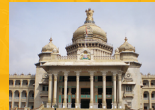
VIDHANA SOUDHA Dist. from Majestic - 2.9 km