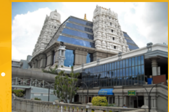
ISKCON TEMPLE Dist. from Majestic - 6 km