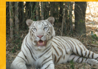
BANNERGHATA PARK Dist. from Majestic - 19.7 km