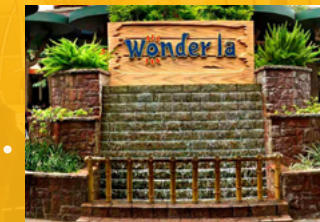
WONDER LA Dist. from Majestic - 28 km