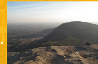
NANDI HILLS Dist. from Majestic - 45.4 km