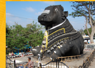
BULL TEMPLE Dist. from Majestic - 3.9 km