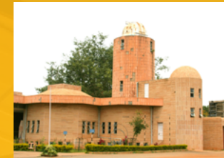
NEHRU PLANETARIUM Dist. from Majestic - 2.1 km