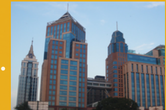
UB CITY Dist. from Majestic - 2.6 km