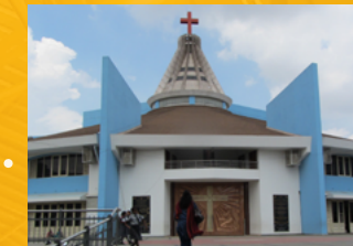
INFANT JESUS CHURCH Dist. from Majestic - 5.7 km