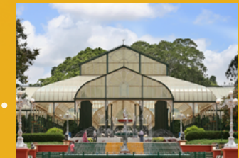
LAL BAGH Dist. from Majestic - 3.3 km