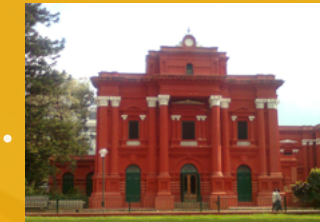
GOVERNMENT MUSEUM Dist. from Majestic - 2.5 km